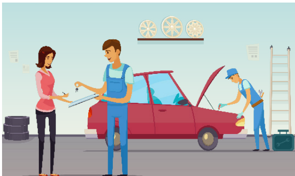
Fiona had her car repaired yesterday.

* We can use the verb get instead of the verb have in informal conversation.